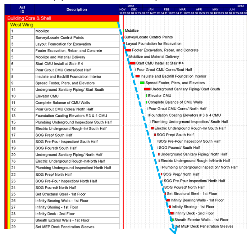
Figure 1 - Project Schedule

were poured in two pours, the erection of the structural wall panels could begin as soon as the first pour is cured and move on forward in this pattern. Similar options to re-sequence activities throughout the project schedule are available when more analysis is taken into consideration. Looking at Figure 1 it is clearly shown that activities were schedule one after the other without any overlap.